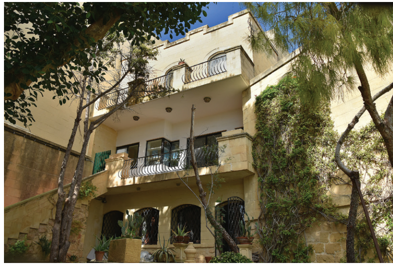
Back facade overlooking garden