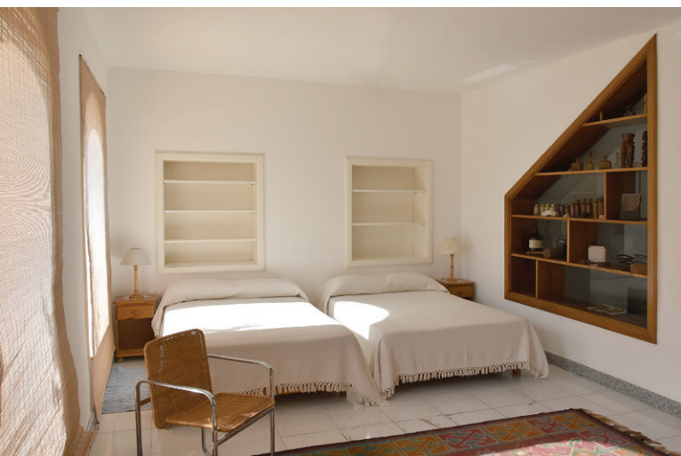
Two single beds in Studio

To qualify for taking part in the residency program, applicants need to be artists, creative professionals, researchers or an undergraduate, graduate or post-graduate student in the artistic and cultural field. Applicants are invited to submit via email their CV along with a portfolio of their recent work and a short (1-page) proposal about how a residency at Gozo Contemporary will benefit their work and the intended outcome or process. Preference will be given to artists and practitioners working in the field of contemporary art.