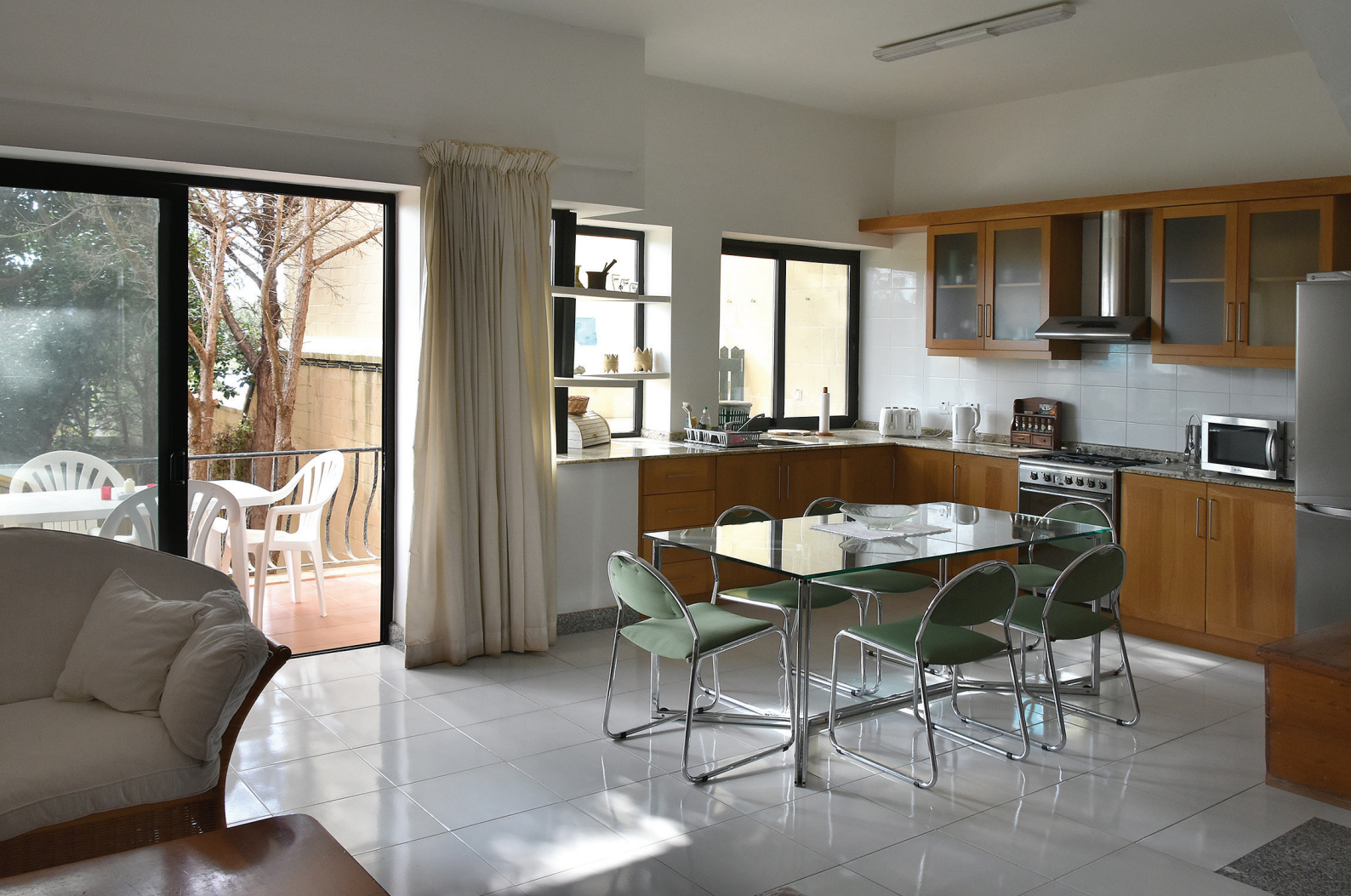
Kitchen / Dining / Terrace