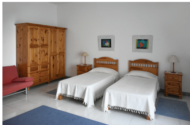
Private Bedroom with shower ensuite