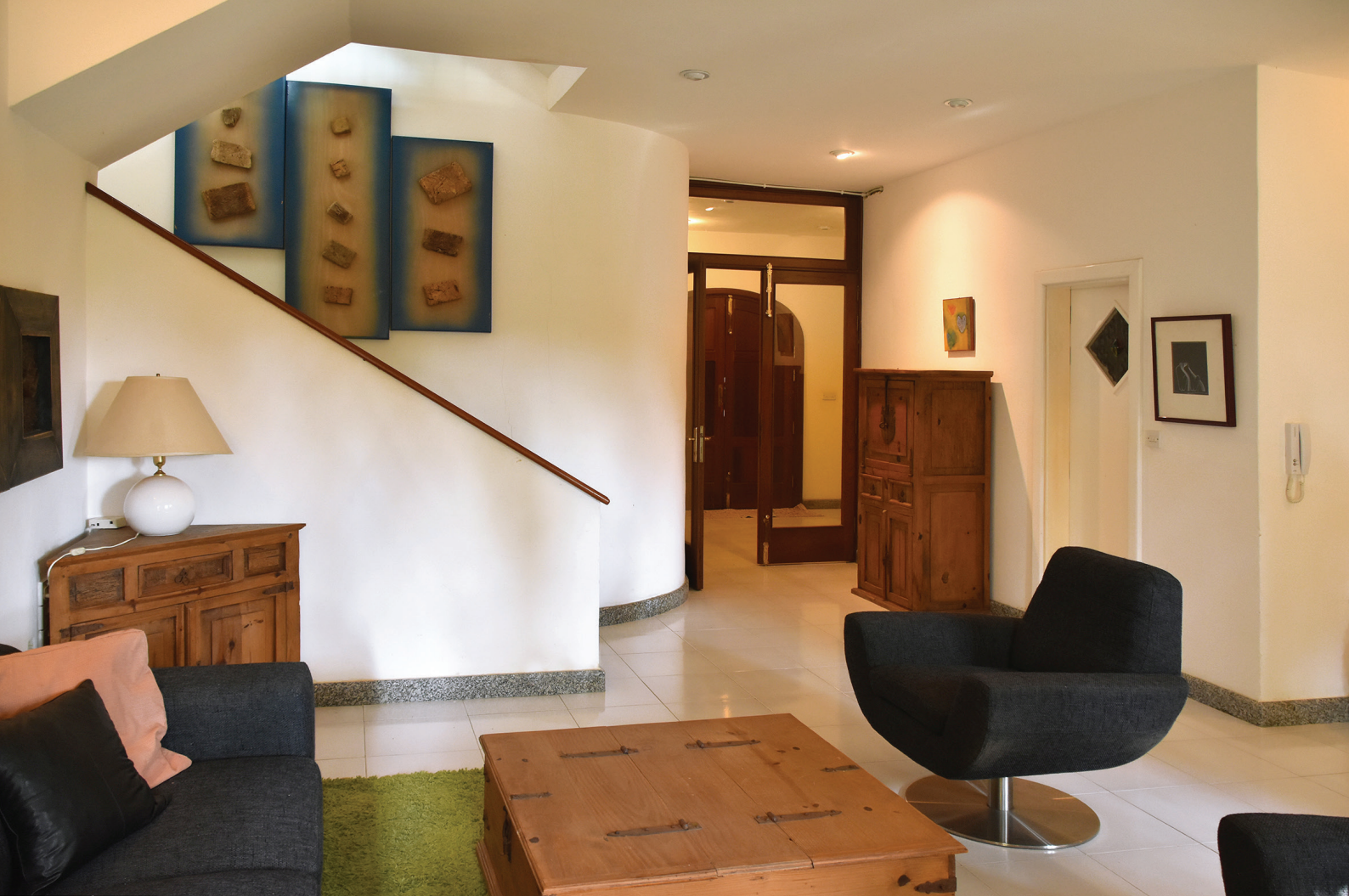
Entrance / 2nd Living Room