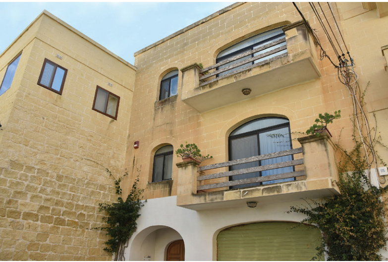
Main Entrance / Facade